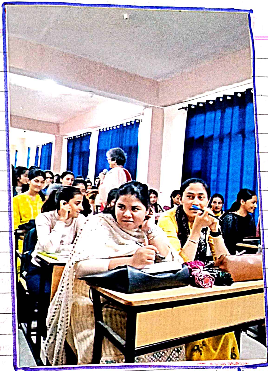
Interaction with 'Students'